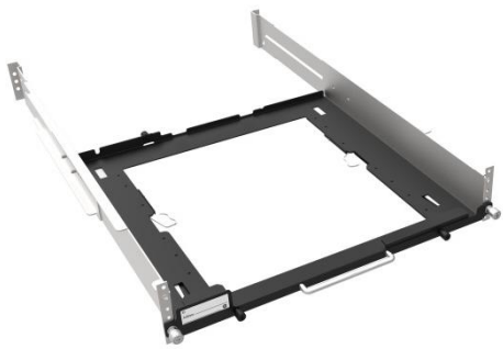
Fig 1 - The HP xw4/Z2/Z4 Rack Mount kit (WH340AA) assembled

The locking system-tray is engineered to provide tool-free access to the workstation. The tray includes release latches to ensure safe removal of the workstation from the server rack and a system ID label for easy identification.