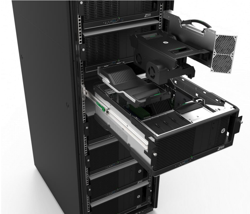
Fig 3 – A Rack-Mounted HP Z820 installed with a HP Z6/Z8 Rack Mount kit (B8S55AA) showing access to interior Workstation components

The HP Z6/Z8 Rack Mount kit rails installs into HP racks without using tools, making setup convenient and efficient. The inner slide and mounting flanges attach to the computer chassis using a set of screws for added strength and stability. The top mounting holes are concealed underneath the top plastic trim, which must be removed along with the rear handle to attach the inner slide and mounting flanges.