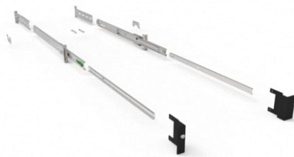
Fig 4 – The HP Z6/Z8 Rack Mount kit (B8S55AA) components

Some of our customers need to mount their workstations into racks that are only 24 inches deep (such as those commonly used in the Broadcast industry), instead of the 29-30 inch deep racks that are commonly used in the industry (including HP racks), so adjustability was an important objective. The HP Z6/Z8 Rack Mount Solution is adjustable to accommodate racks 24 – 30 inches deep. For convenience, the adjustable rails are shipped configured to fit standard HP racks.