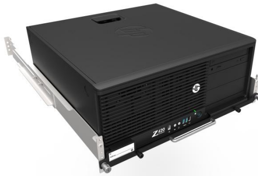
Fig 2 - The HP Z420 installed in a xw4/Z2/Z4 Rack Mount kit (WH340AA)