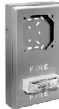
REMOTE PLATE with SBL-2