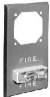
RSSP REMOTE PLATE