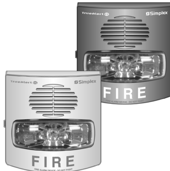
TrueAlert ES Addressable A/Vs are Available in Red with White Lettering and White with Red Lettering